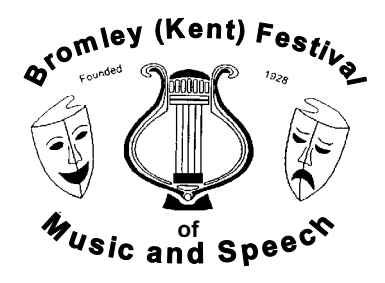
Patron: The Worshipful The Mayor of Bromley